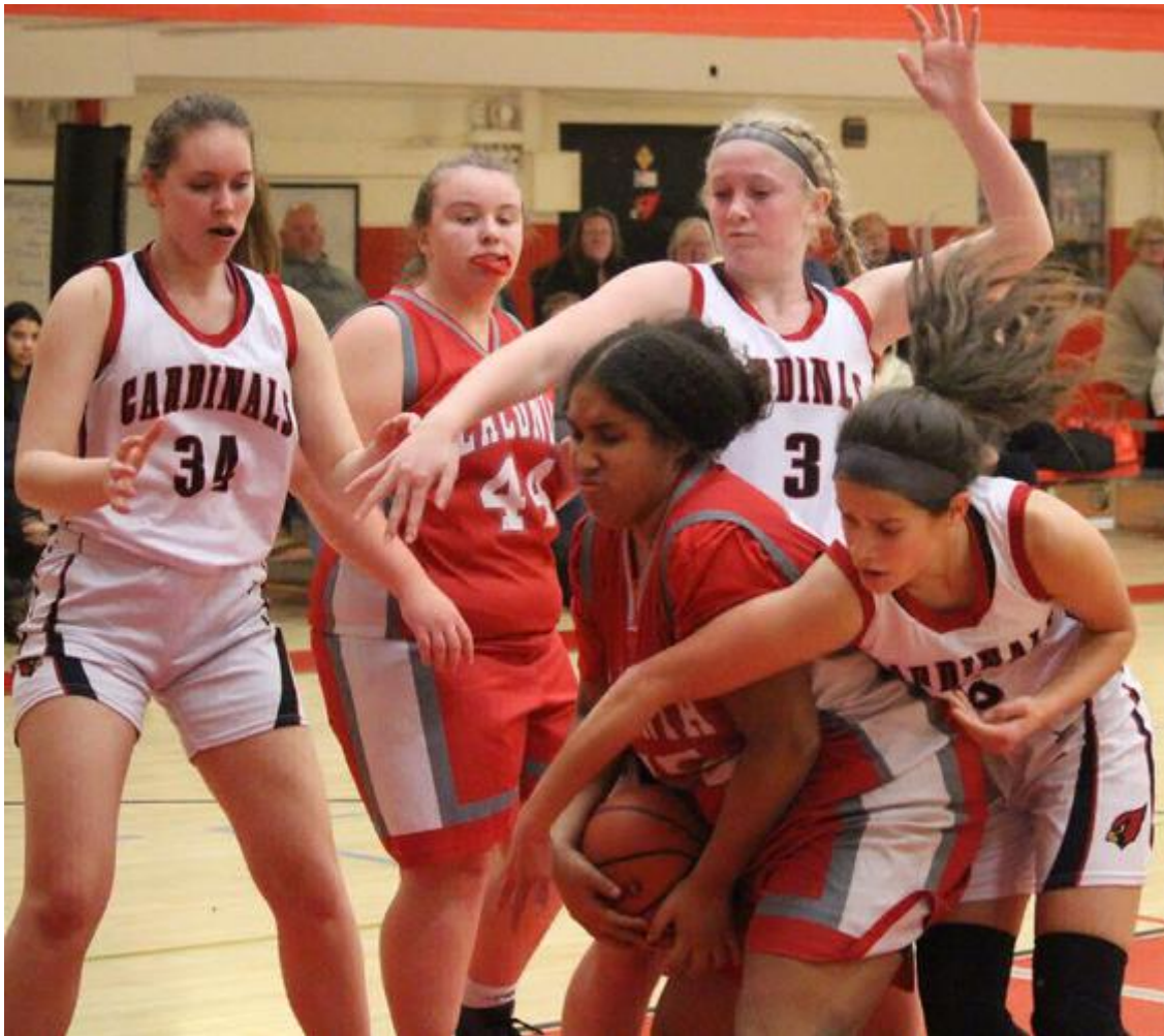
The Laconia Sachems were in town Friday evening to take on the SHS girls basketball teams. Cardinals JV team won by 10 while the varsity team lost by 7.