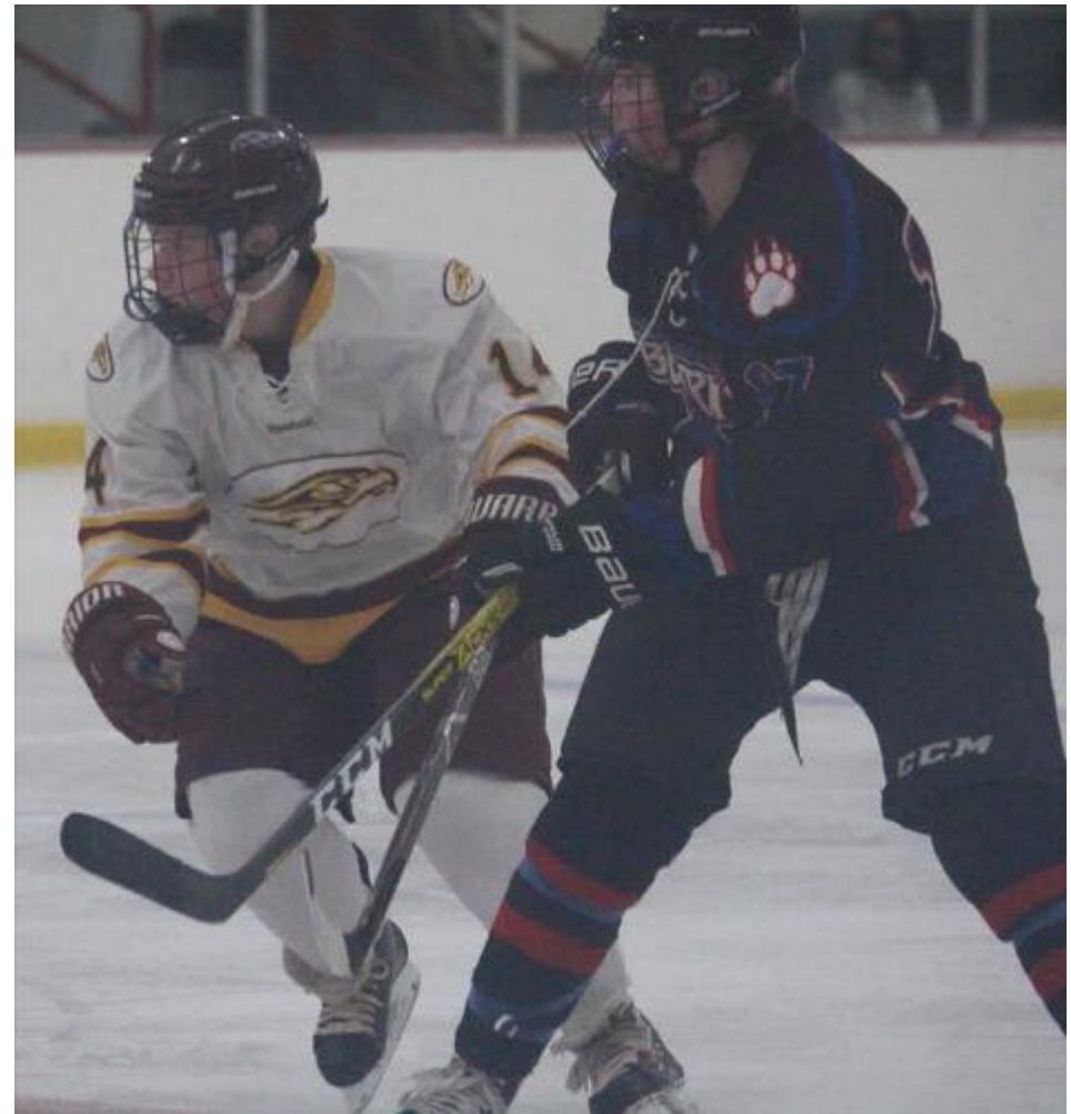
Tough overtime loss for the Lebanon-Stevens-Mt. Royal Boys Ice Hockey team Saturday night at Champion Arena. Somersworth-Coe Brown tied the game up with a minute and a half left to go in regulation and then scored two minutes into the extra frame to win 3-2 (Courtesy photo).