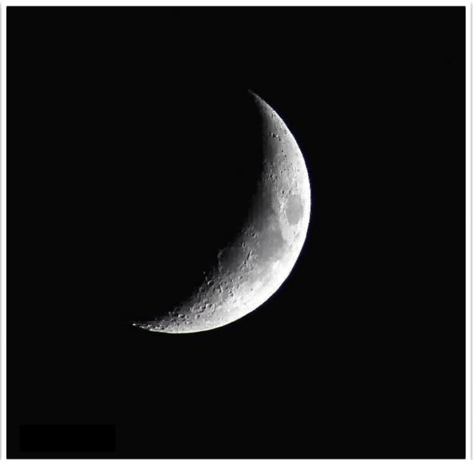
Clear skies made for some easy star gazing last week, or in this case, moon gazing.