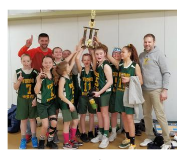
Above: Windsor Below: Valley Youth All Stars Black Team