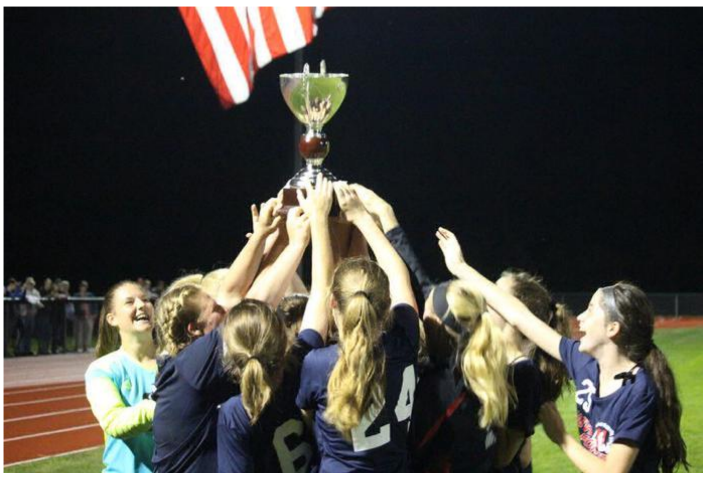
The varsity girls soccer teams from Stevens and Fall Mountain competed in the annual Charity Cup. This year the two teams raised money for the NH 9/11 Memorial Stair Climb; the Cardinals defeated the Wildcats to claim the Charity Cup.

Friday, Oct 12, 7pm at the Charlestown Middle School will be a Dodge Ball Tournament