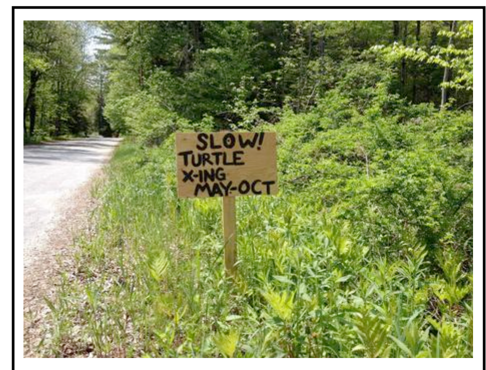
Drivers on the Lempster portion of Crescent Lake Road are being greeted by a sign warning of a turtle crossing. Slow going for drivers and four-footed "pedestrians"? (Phyllis A. Muzeroll photo).

CLAREMONT, NH--The Claremont Farmers' and Artisans' Market will be held every Thursday through October 6th, from 4:00-7:00 p.m. (rain or shine); they only call the market for lighting. A strong selection of vendors with more added weekly and a great music schedule.