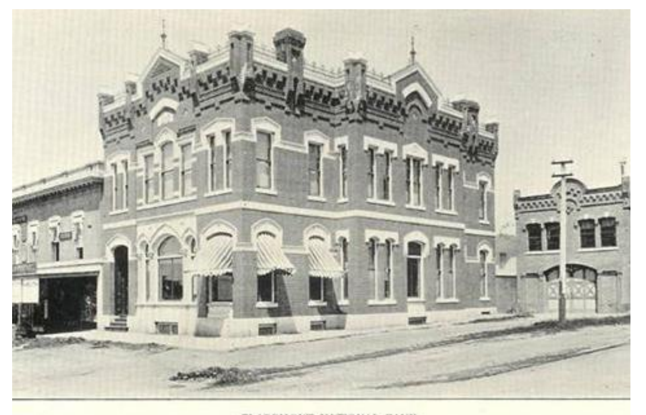
CLAREMONT NATIONAL BANK

Top: Tremont Square in Claremont really did have bulls in it at one time; hence, the name "bullpen" that has been in the local news so much lately. Below: Claremont National Bank (Photos, courtesy of Merle Boardman).